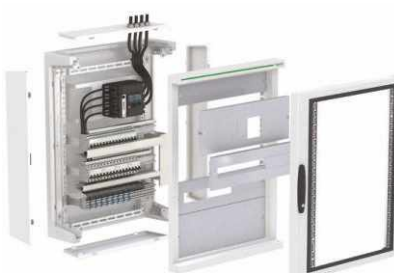
> Example of 16 modules wall mounted switchboard