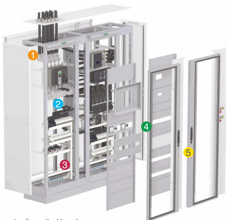
> Example of floor standing switchboard

Switchboards designed and manufactured with the Prisma iPM solution have all the qualities needed to ensure energy availability. They are organised by function and by zone, which improves reliability and facilitates design, installation, operation and upgrading. All switchboard architectures are factory tested in line with specifications that go well beyond the IEC 61439-1 standard. The same continuity of service is ensured throughout the switchboard's entire life cycle.